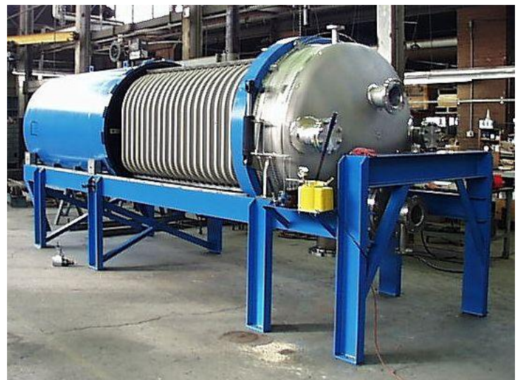
Durco Filters HC Horizontal Pressure Leaf Filter

Durco Filters Pressure Leaf Filters can separate colloidal debris from the process stream which would otherwise block the effective adsorption of sucrose by the resin beads. Best-in-class flux rates and extended run times make Durco Pressure Leaf Filters the ultimate technology for this application.