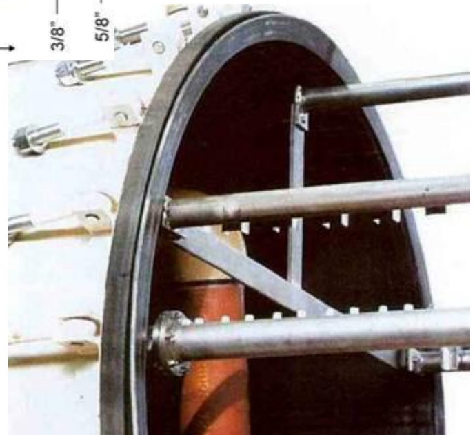
T-Section Gasket installed in a new 72" rubber-lined Durco pressure leaf filter unit:

Durco Pressure Leaf Filters Information Durco Pressure Leaf Filters PDF File