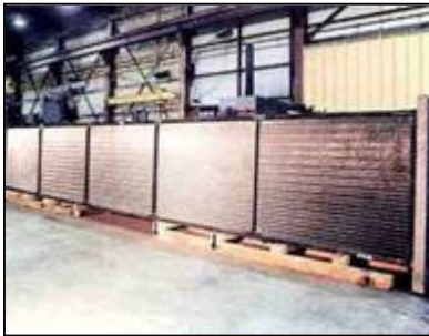
Plate-Fin Heat Exchangers