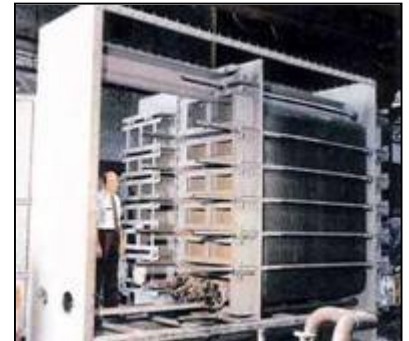
Plate & Frame Heat Exchanger