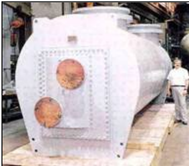
Plate-Fin Heat Exchangers